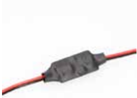
ACSC005COCIRCPXX200 Piccolo circuit with sheath heat-shrinkable for SPOT D15