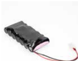
ACSCXXXCOPLITHXX26 Pack Lithium 2,6Ah