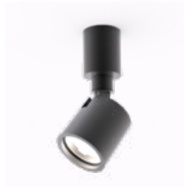
ACSD0XXFIPATLGBK Tall peg SPOT Black (BK), White (WH), Custom (CU)