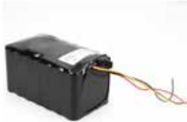
ACSCXXXCOPLITHXX010 Pack Lithium 10,4Ah