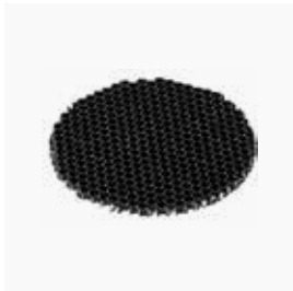
ACBBL15OPNIDABBKD51C Honeycomb SPOT D15