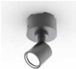
ACSCXXXFIPATERBK*APP Surface mounted SPOT Black (BK), White (WH), Custom (CU)