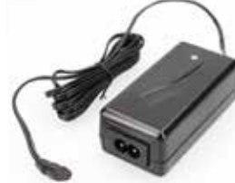
ACSCXXXCOCLITHXX06 Charger Pack Lithium Charger 29,4V 0,6A