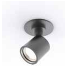
ACSCXXXFIPATERBKENC Recessed peg SPOT Black (BK), White (WH), Custom (CU)