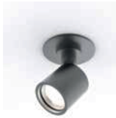
ACSCXXXFIPATERBKENC Recessed peg SPOT Black (BK), White (WH), Custom (CU)