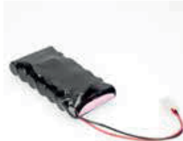
ACSCXXXCOPLITHXX26 Pack Lithium 2,6Ah