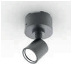
ACSCXXXFIPATERBK*APP Surface mounted SPOT Black (BK), White (WH), Custom (CU)