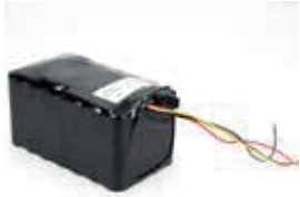
ACSCXXXCOPLITHXX010 Pack Lithium 10,4Ah