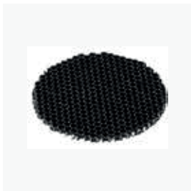
ACSD0812NIDABBKC Honeycomb SPOT D8 ou D12