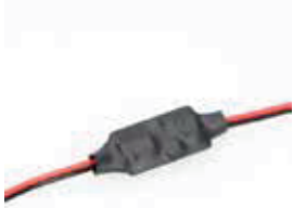
ACSC005COCIRCPXX200 Piccolo circuit with sheath heat-shrinkable for SPOT D8