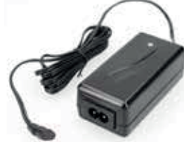
ACSCXXXCOCLITHXX06 Charger Pack Lithium Charger 29,4V 0,6A